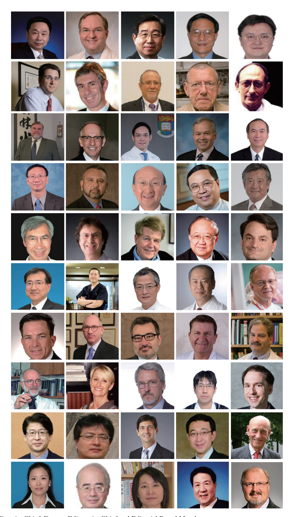
Figure 3 HBSN's Editor-in-Chief, Deputy Editors-in-Chief and Editorial Board Members.